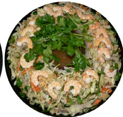
P7. Khay Gỏi Sứa Tôm Thịt