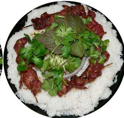
P8. Khay Bánh Hời Gà/Thịt Nướng