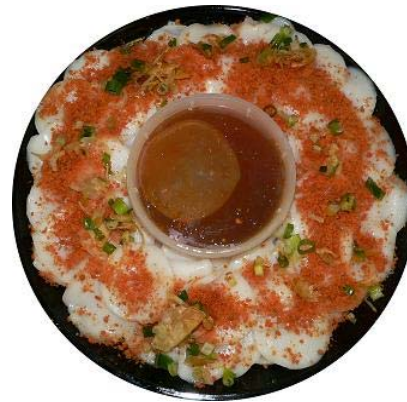
P1. Khay Bánh Bèo