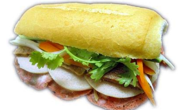
Shown: M1: Bánh Mì Đặc Biệt (Thịt Đỏ, Chả Lụa, Paté) - Special