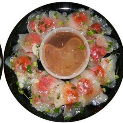
P3. Khay Bánh Bột Lọc Trần