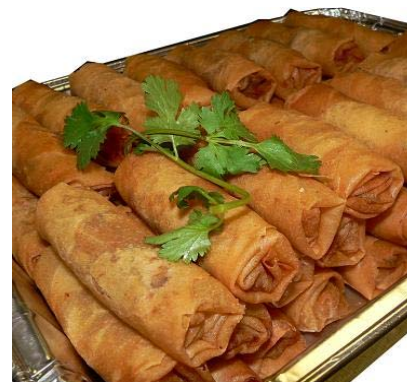
S1. Chả Giò (Vietnamese Eggroll)