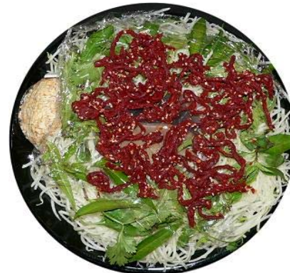
P17. Gỏi Đu Đủ Bò Khô