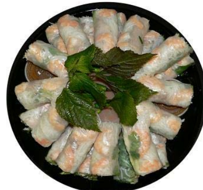
P5. Khay Gỏi Cướn Tôm Thịt