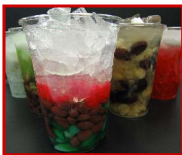
Shown: Chè ba màu, Chè thái, Chè chuối