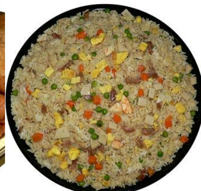
LP1. Cơm Chiên