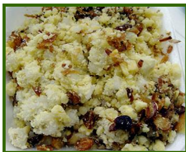
Shown: Xôi Bap