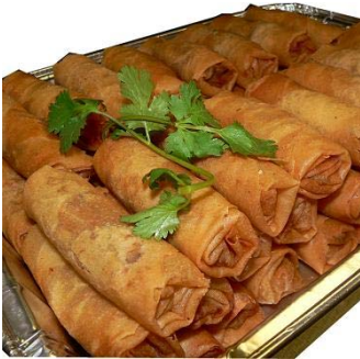
VS1. Chả Giò (Veg. Eggroll)