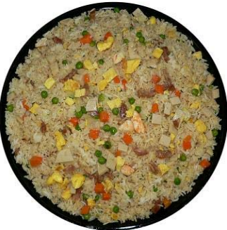
V15. Cơm Chiên Chay