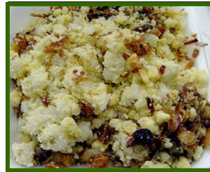
Shown: Xôi Bap