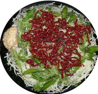
V6. Gỏi Đu Đủ Bò Khô Chay