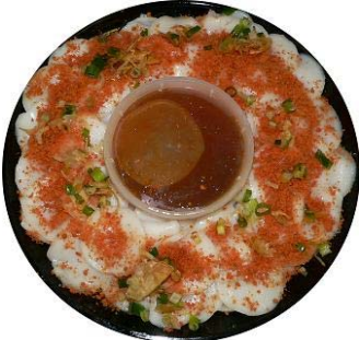
V1. Bánh Bèo Chay